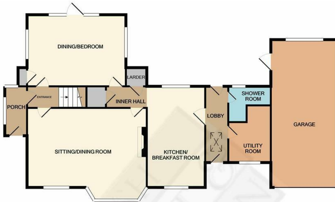
GROUND FLOOR APPROX. FLOOR AREA 1202 SQ.FT. (111.6 SQ.M.)