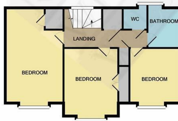
1ST FLOOR APPROX. FLOOR AREA 524 SQ.FT. (48.6 SQ.M.)

TOTAL APPROX. FLOOR AREA 1725 SQ.FT. (160.3 SQ.M.)